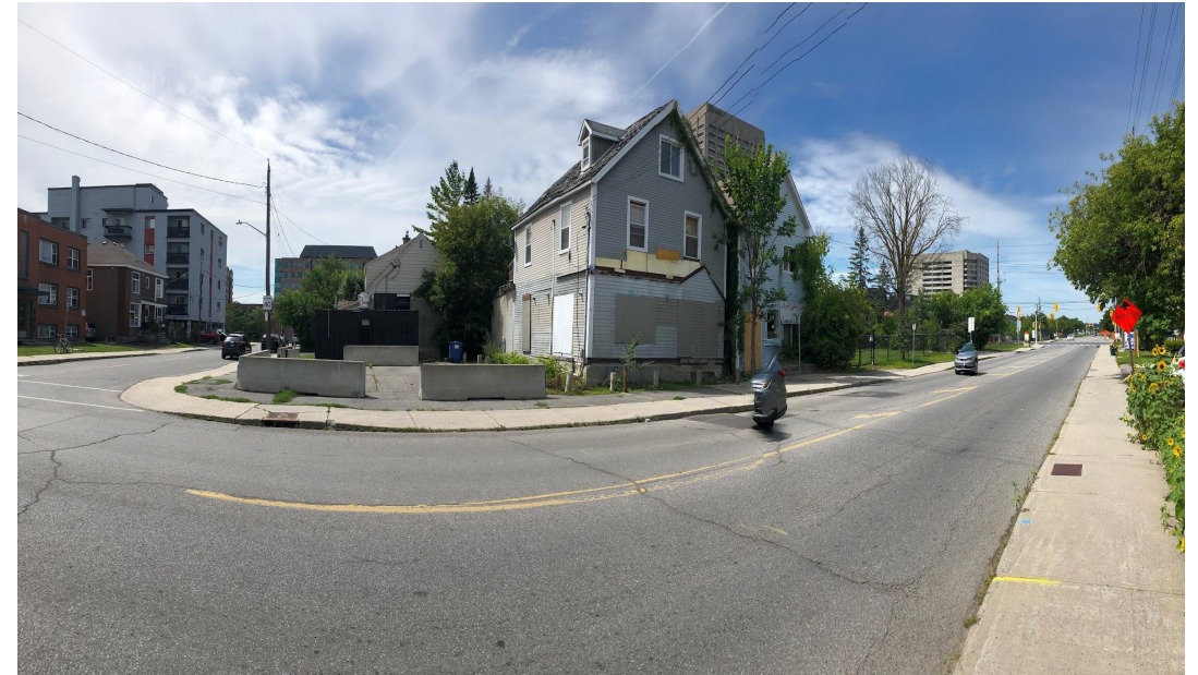
272 and 274 Parkdale Ave